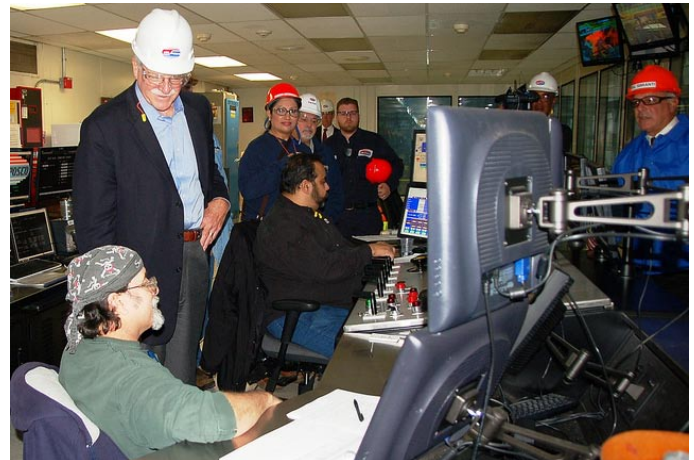
Rep. Miller at the exit pulpit of KMCAL