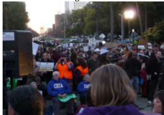
"Stand with Wisconsin Workers" Rally in Sacramento 2/22/11

state law that guarantees a lunch break and 1 of only 7 states that require a rest break to workers. I hope that we in California don't become complacent with our Brothers' fight in Wisconsin. It is ours fight too. What is happening in Wisconsin and Ohio is because there are Republican legislators and Republican Governors exercising the "tea baggers" will. Thank god that Meg Whitman didn't get voted in as Governor, or who know what she might have done to weaken workers rights.