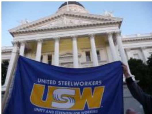
Wisconsin Workers' Rally in Sacramento 2/22/11

We have all seen on the news what has happened in Wisconsin. Our Union brothers and sisters are fighting for their rights and OURS. Gov. Walker was successful in breaking the Public Employees Union's right to collective bargaining. Look for a negative action like this to spread..